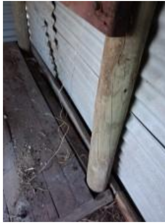
The chicken house structure is in direct contact with the ground and can attract termites