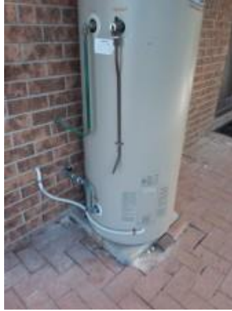
Hot water heater Overflow to the main house and the granny flat a dripping water to external walls this can attract termite activity due to moisture buildup recommend plumbing into drain