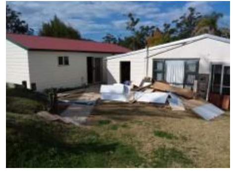
The old shed show signs of structural damage due to previous termite activity