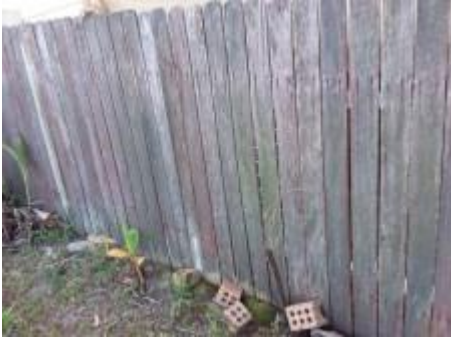
timber fence posts and fencing in direct contact with the ground and can attract termite activity