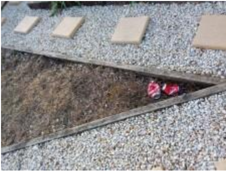
Garden Timbers are in direct contact with the ground and can attract termite activity