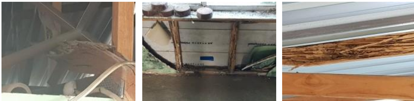
Extensive structural damage 2 old shed building