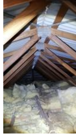
Roof void to granny flat