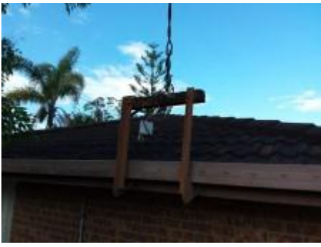
Severe wood rot to electric entry point to main house