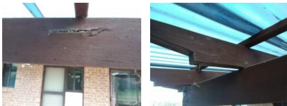
Slight wood rot to pergola covering rear patio