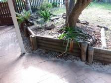
Wooden retaining walls are in direct contact with the ground and can hide termite activity to the property