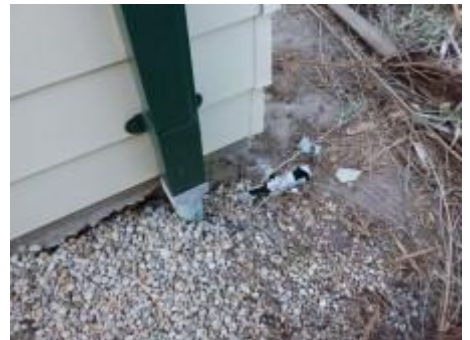
Damaged down pipe drainage to granny flat