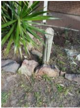
Weathering and slight wood rot to garden Timbers